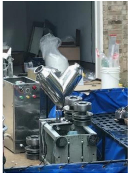
Figure 2<sup>10</sup> Figure 3<sup>11</sup>

Pill presses or encapsulating machines that are imported into the United States without the proper notification are subject to interception, seizure, and destruction by U.S. Customs and Border Protection (CBP). This equipment is also subject to forfeiture by the DEA.