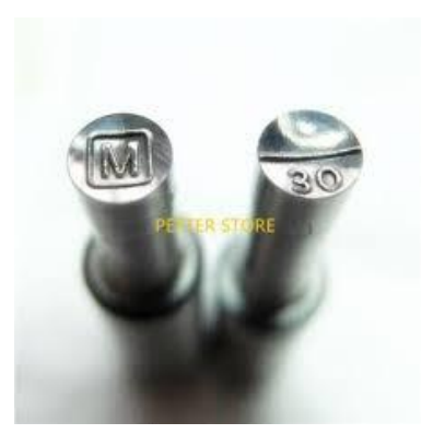
Figure 6 14